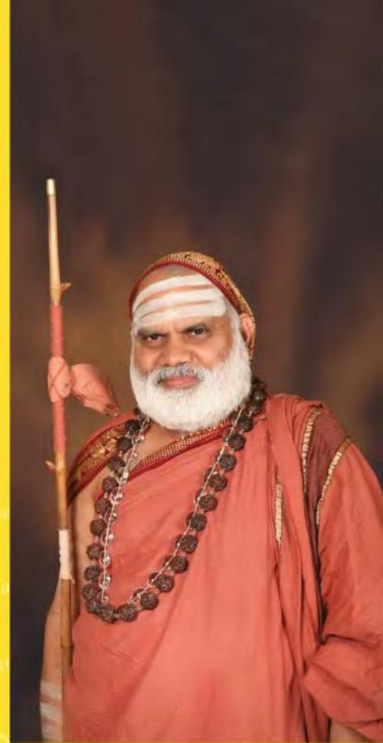
JAGADGURU SRI SRI BHARATI TIRTHA MAHASWAMIJI